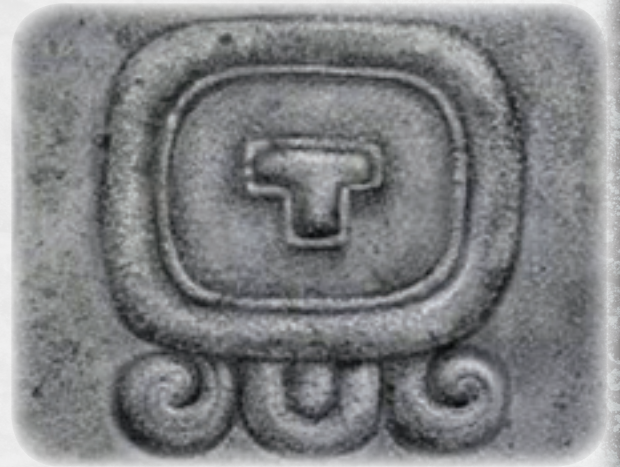
FIGURE 4 - Tau symbol in IK glyph