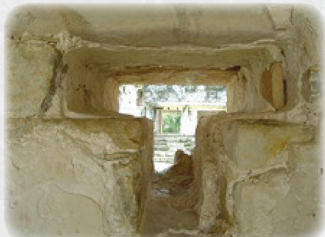
FIGURE 3 - Palenque House "C" with Maya T-shape

worldwide in various forms in ancient civilizations such as Egyptian, Babylonian, Phoenician, American Indian and the Maya. In Maya the tau symbol is represented in hieroglyphs, structures