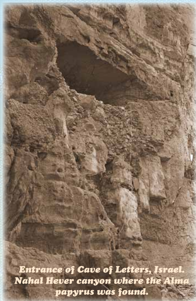
Entrance of Cave of Letters, Israel. Nahal Hever canyon where the Alma papyrus was found.

...Jeremiah the prophet before the Lord [...wh]o were taken captive from the Land of Jerusalem. 4