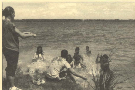
Interns and youth at the retreat enjoyed swimming and playing games in the lagoon.