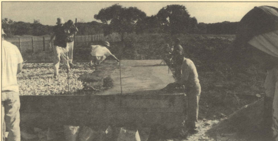
Pouring a 20 x 24 foot slab of concrete for the second house took seven hours.