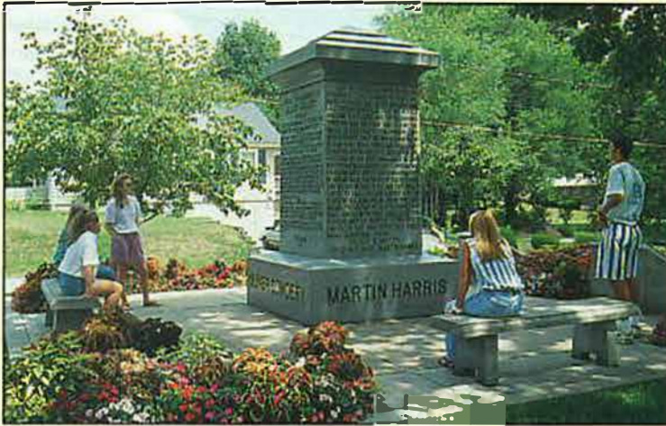
Old Saints' Cemetary, Richmond, Missouri

From the staff and students of the 1994 internship program, I thank all of you who have made this program possible. Many have donated time and money and offered prayerful support. Godspeed to all until the days of