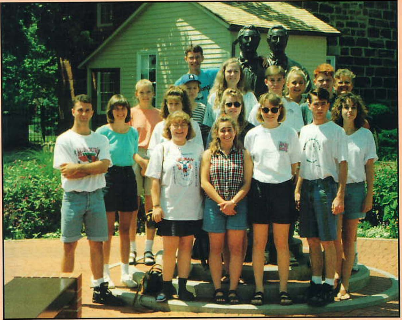
The 1994 summer interns enjoy a beautiful afternoon in Nauvoo.