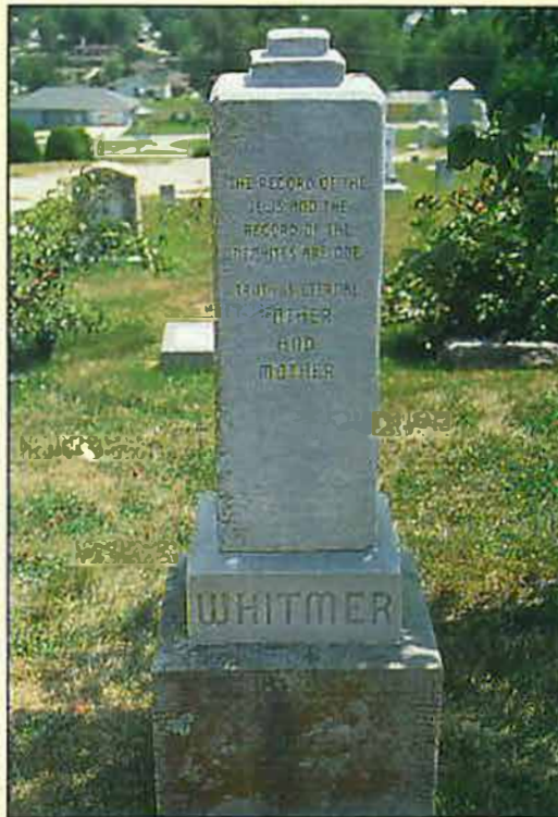
David Whitmer Grave, Richmond, Missouri