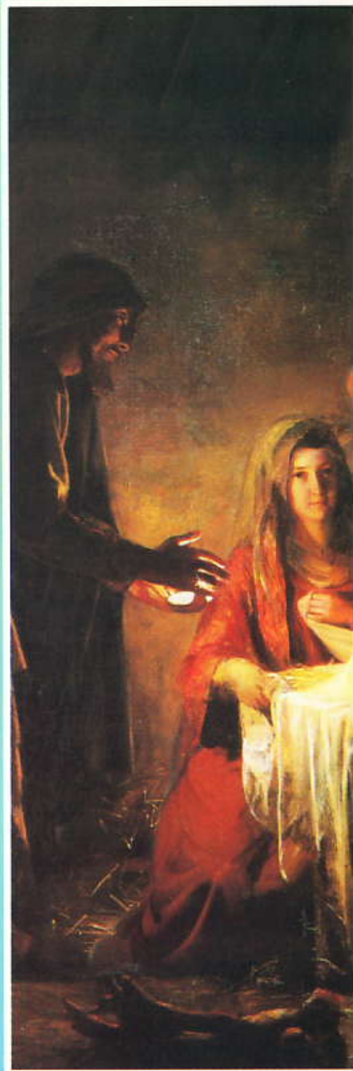
The Birth of Jesus by Carl Bloch.

What a commission he was given, and what a sacrifice was required in order to fulfill what the Lord was commanding him to do. But in faithful obedience, Lehi took his family, forsaking all that he owned (and he evidently was a wealthy man), and departed into the wilderness to fulfill his Father's bidding. Many, including two of his sons, thought Lehi was a foolish old man who was living out his vain imaginations at others' expense. They did not