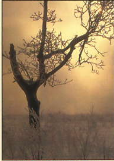
THE UN NOURISHED WORD

Nearly one hundred years after Alma's exhortation to the Zoramites, Jesus Christ, speaking to the multitudes, tells them of a sower who went forth to sow. In this parable, Christ also compares the word to a seed as he describes the various ways in which the word is received into people's lives (Matthew 13:3-21).