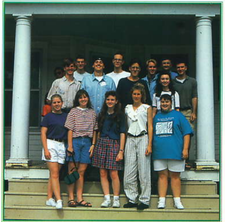
1995 FRAA Interns

The deadline for submitting applications is April 1, 1996.