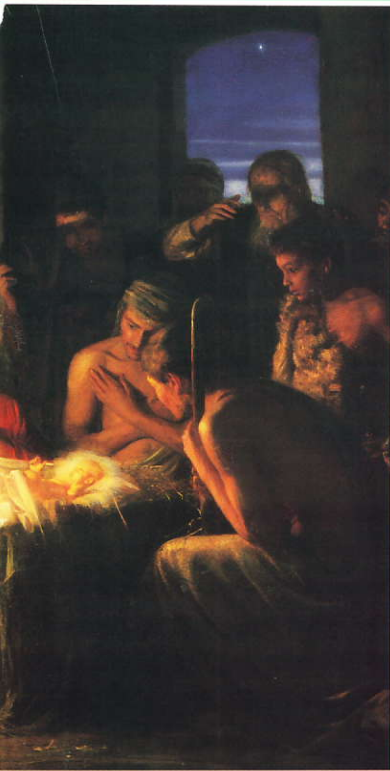
Original at the Chapel of Frederiksborg Castle, Denmark.

believe God had directed him to do anything — it seemed ludicrous to them that God would require such a thing of anyone. In reality, Lehi was so familiar with the word of God that not only had it become flesh to him, but he himself was making it flesh by his faithful obedience, in spite of the incredible personal cost to him and his family.