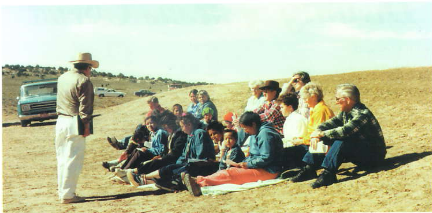
The preparation of the people is of great significance.

wall to which his people will hasten. Could that be Zion, the place of protection for his people?