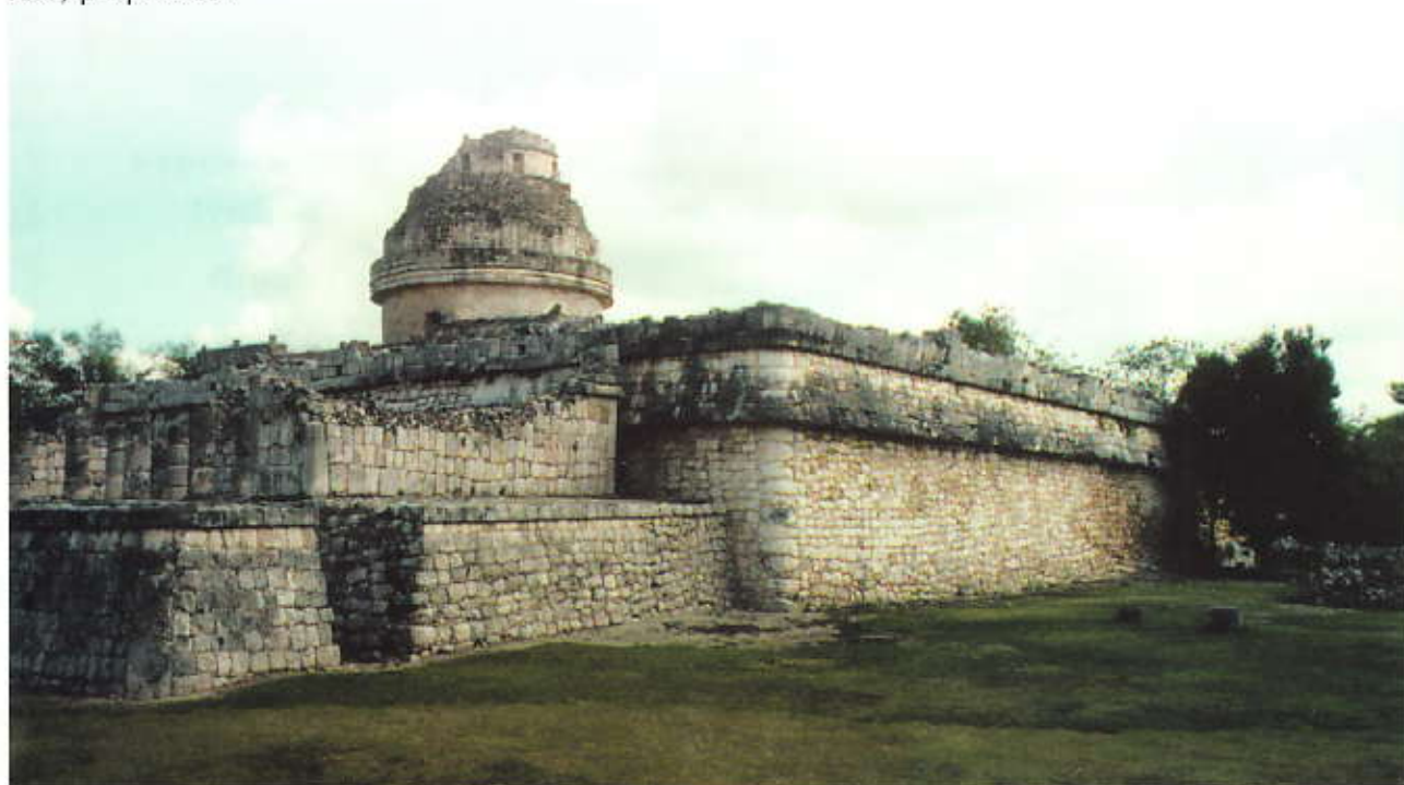
Observatory at Chichen Itza.

Whether from the jungle rain forests of Mesoamerica or from the Isle of Patmos, the prophets agree that "the testimony of Jesus is the spirit of prophecy." 16 While it would be a prize understatement to say of our time that humanity's plans have been confounded, Book of Mormon prophets and timekeepers assumed history and time were God's creation. We agree. God invaded history in the person of Christ Jesus and even though history and time may always be punctuated by apparent forsakenness, they are yet the place of God's self-disclosure, and therefore, prophetic. 17