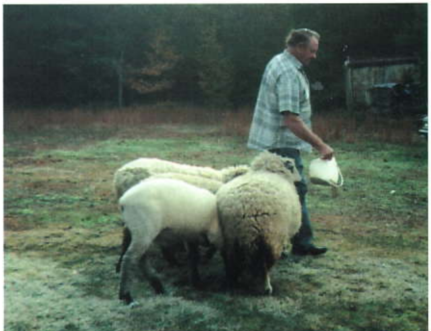
My sheep hear my voice.

Although this prophecy was given in an ancient time, the description of our common means of transportation today is quite accurate. We might also consider that the Lord will "recount his worthies" at this time. Why should he need to recount his worthies except that there might be those who are not prepared to meet him. The prophet further indicates that there will be a need for a defense and that there will be a