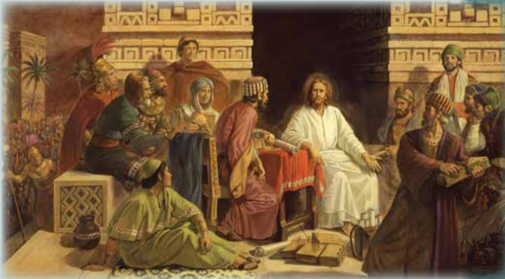
Bring Forth the Record

When Jesus was challenged by the Pharisees or scribes over doctrine or the law, He often answered, It is written . Jesus could have simply said, "Because I said so." Although seemingly self-serving, this would be the same as saying, It is written , because it was Jesus who was inspiring the prophets all through time. Jesus was reinforcing the need to know the word, to learn how God has worked among the children of men in all times and all places. In this way we come to know and more fully comprehend the promises of God, the characteristics of God, the timelessness, faithfulness and enduring love