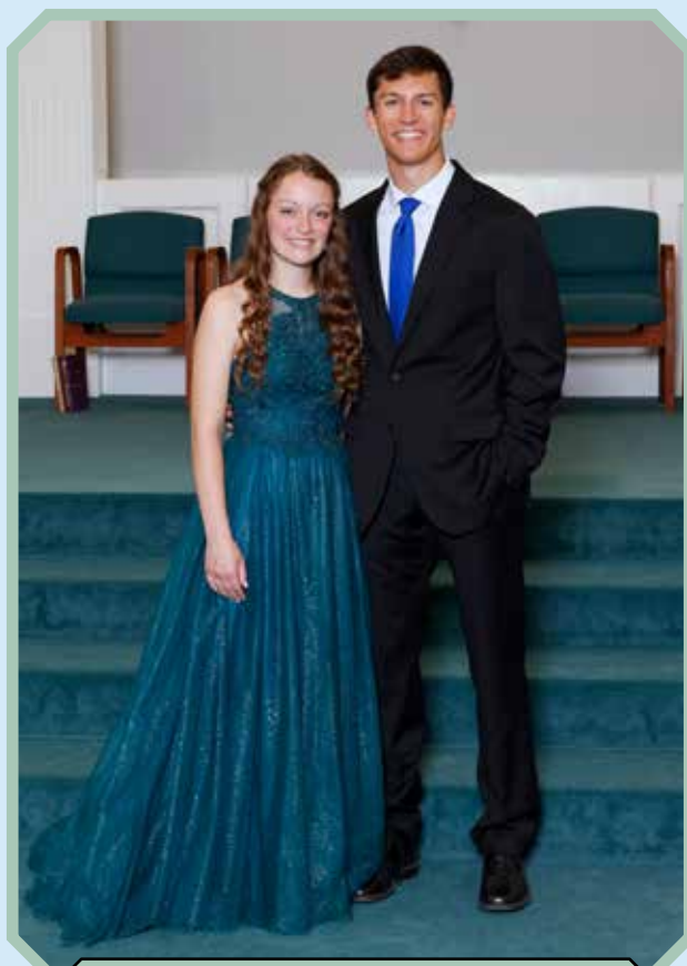
2025 Intern Staff